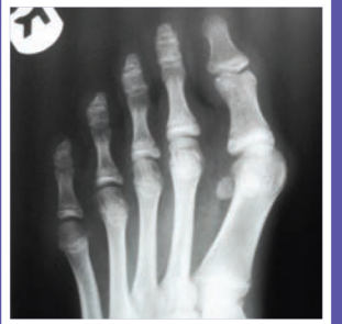
Juvenile HAV (PreOp)