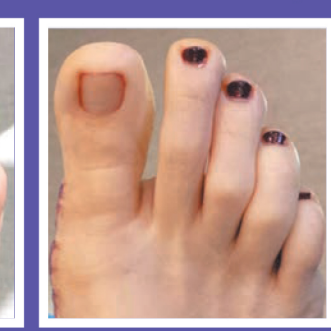
Before Bunion Surgery After Bunion Surgery